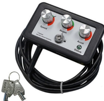
(Navitas "OTF" On The Fly Programmer)